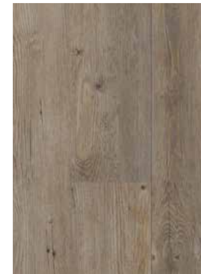
TAJ-703F Gray Barnwood | 7" x 48"