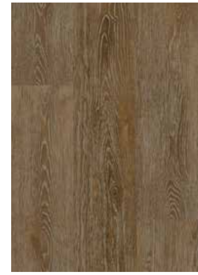
TAJ-6061F Palomino | 7" x 48"