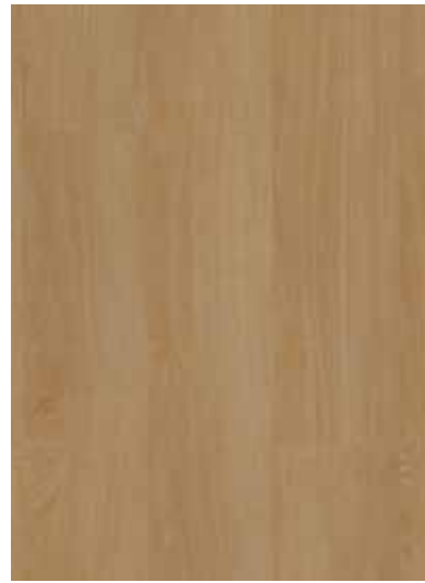
TAJ-628H Blonde | 6" x 36"