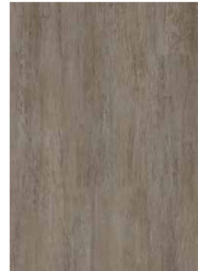
TAJ-705F Windy City | 7" x 48"