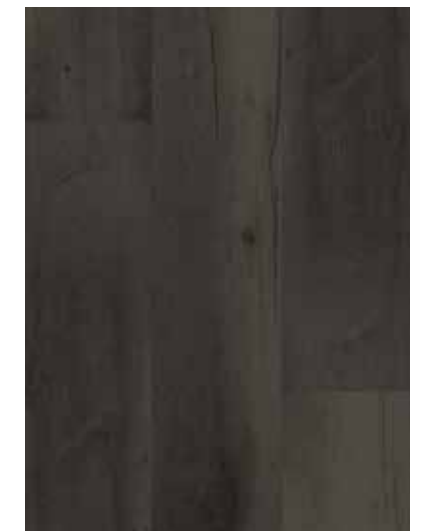
NVF-2533 Dove Gray | 7" x 48"