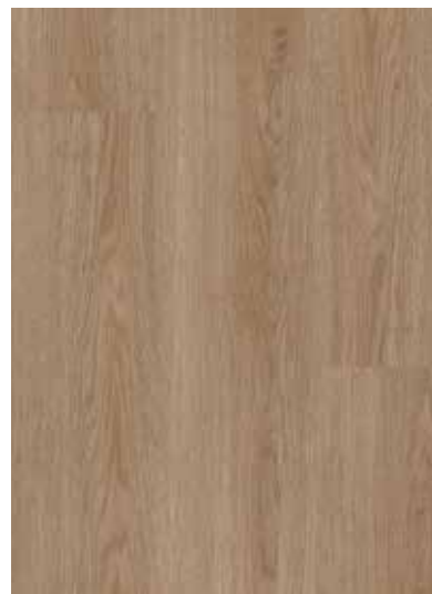
TAJ-9125 Corrugate | 7" x 48"