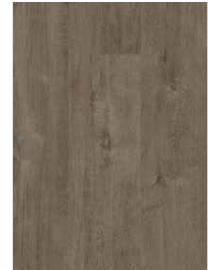
TAJ-6068F Greyhound | 7" x 48"