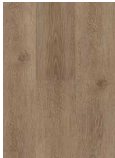
TAJ-744F Vintage | 7" x 48"