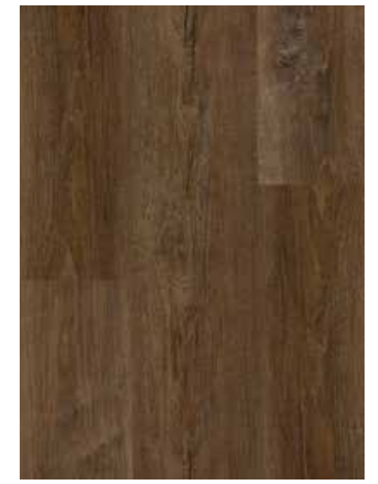
NVF-2501 Wynwood | 7" x 48"