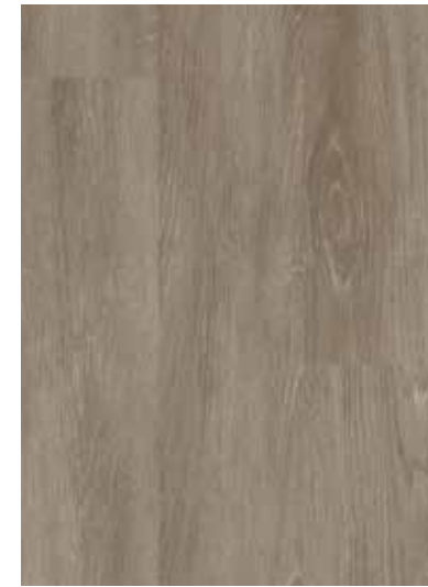
TAJ-2701H River Birch | 6" x 36"