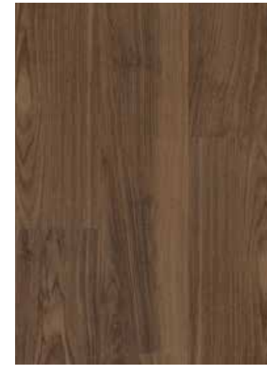
TAJ-682H Mocha | 6" x 36"