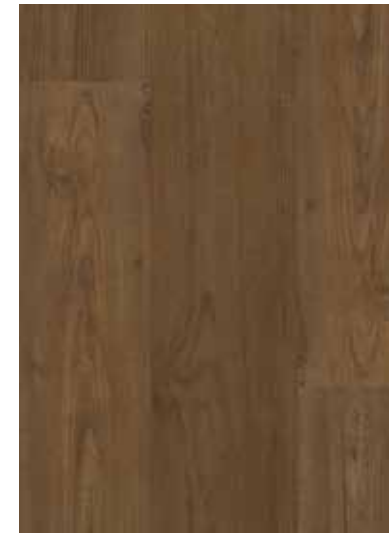
TAJ-708F Cabin | 7" x 48"