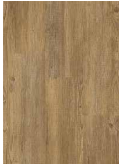
TAJ-9123 Cortez | 6" x 36"