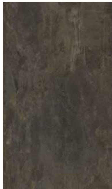
TAJ-501G Oil Stained