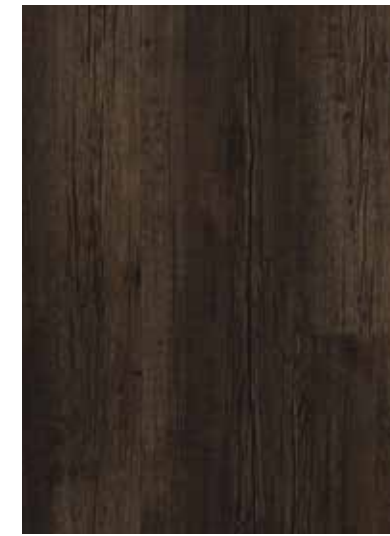
WAF-5136 Foxtail | 7" x 48"