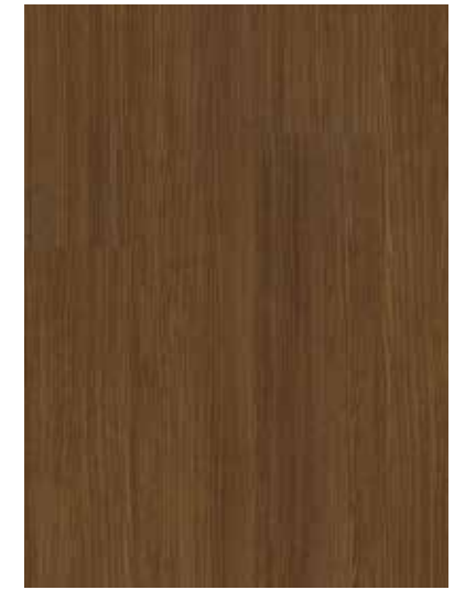
NVH-2732 Old Oak | 6" x 36"