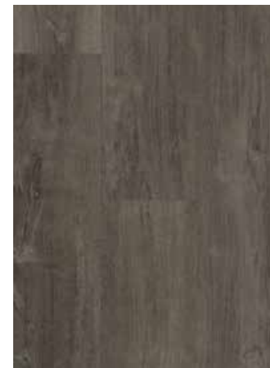
TAJ-6070F Husky | 7" x 48"