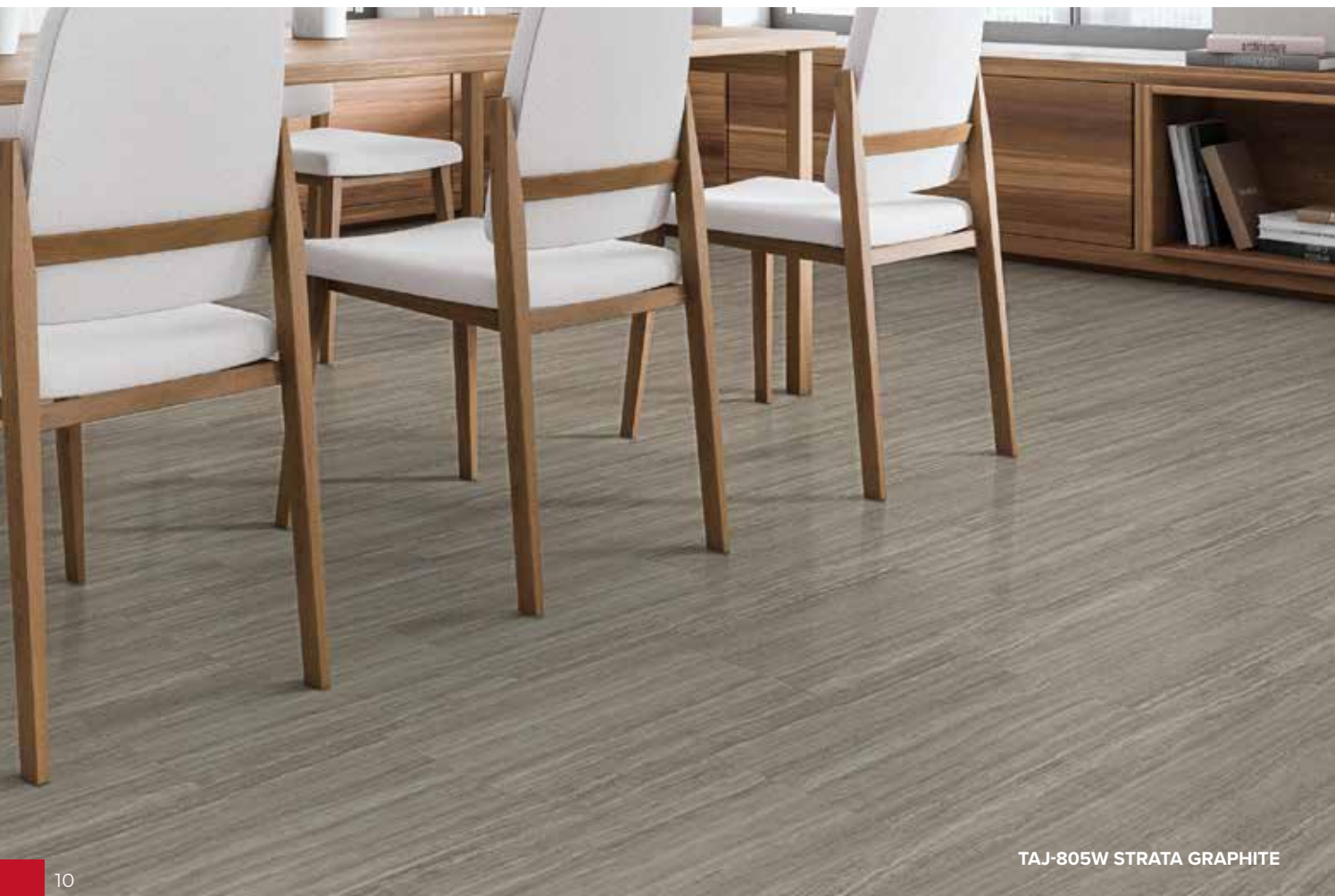
TAJ-805W STRATA GRAPHITE