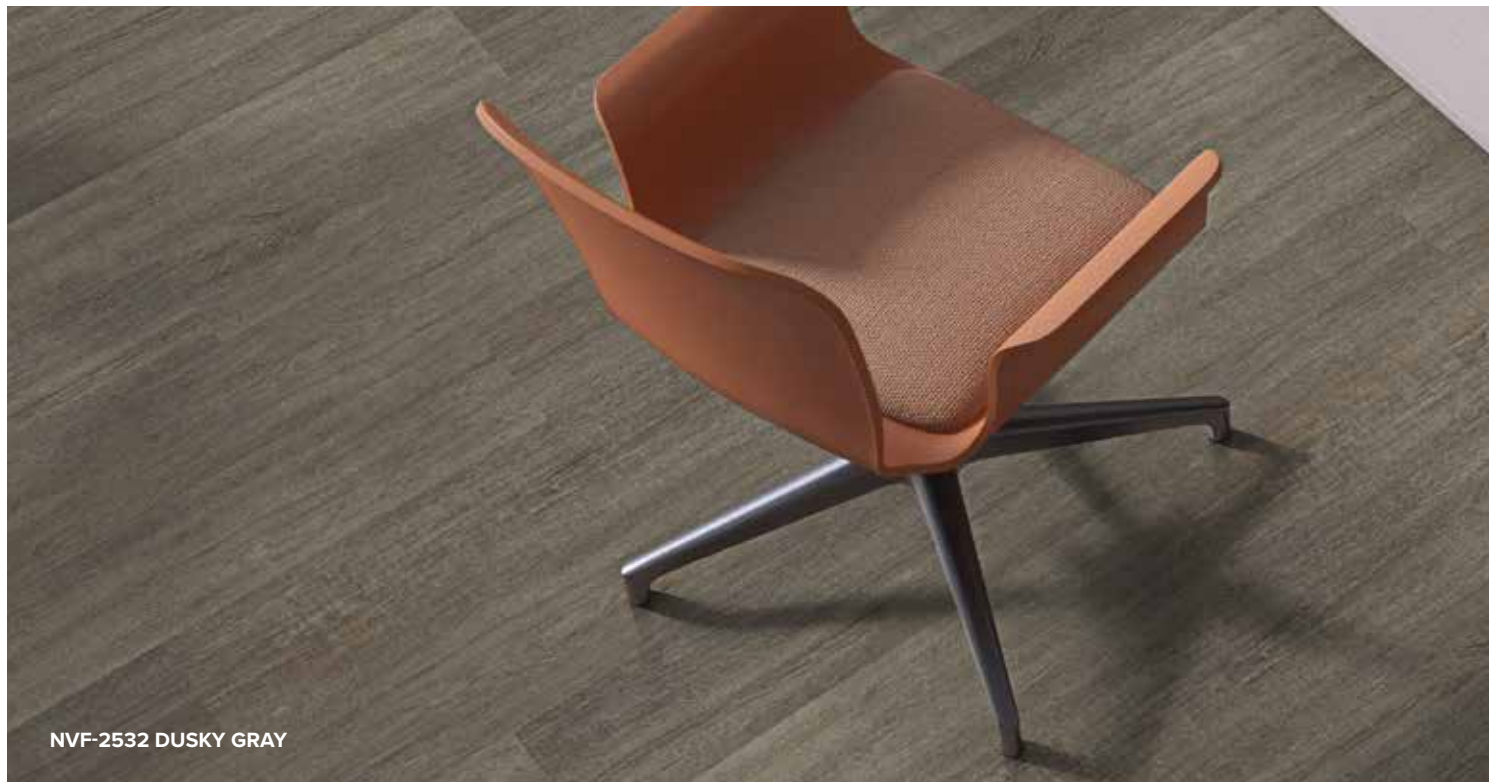
NVF-2532 DUSKY GRAY