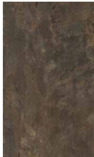
TAJ-502G Rust Patina