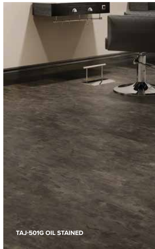
TAJ-501G OIL STAINED