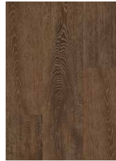
TAJ-6062F Hackney | 7" x 48"