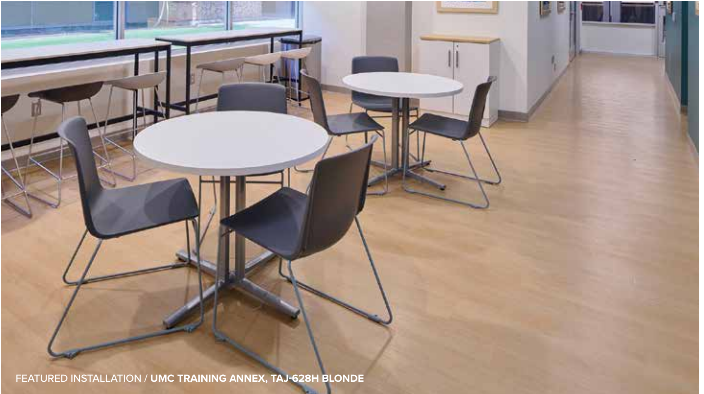
FEATURED INSTALLATION / UMC TRAINING ANNEX, TAJ-628H BLONDE