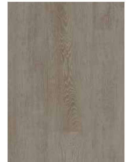
TAJ-6063F Arabian | 7" x 48"