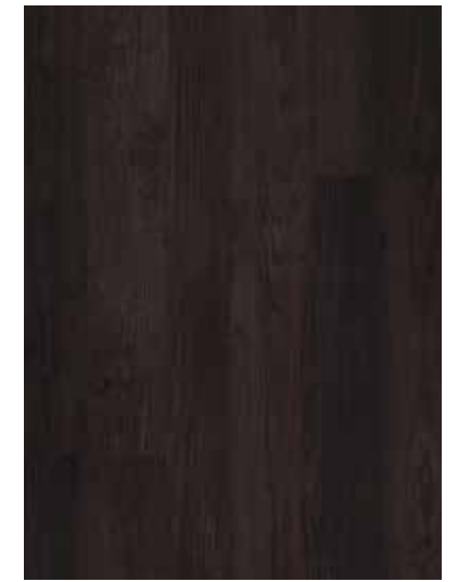
TAJ-709F Espresso | 7" x 48"