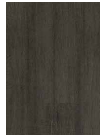
TAJ-706F Big Apple | 7" x 48"