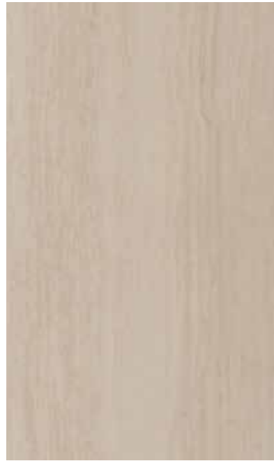
TAJ-804W Strata Crème