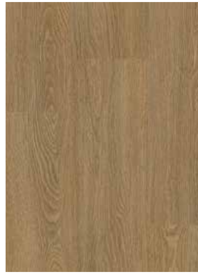
TAJ-9124 Cane | 7" x 48"