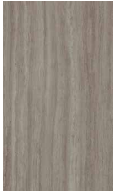
TAJ-805W Strata Graphite