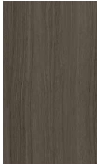
TAJ-812W Tidal Wave