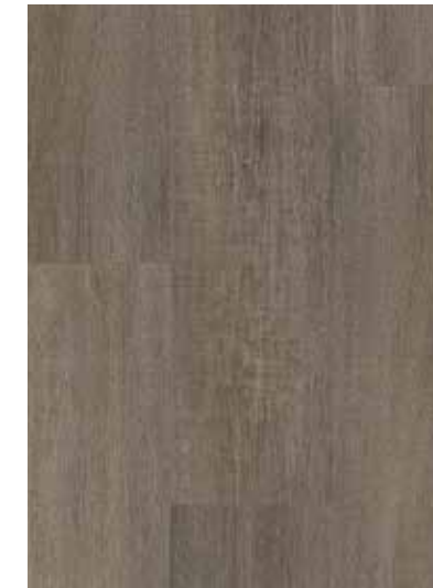
NVF-2532 Dusky Gray | 7" x 48"