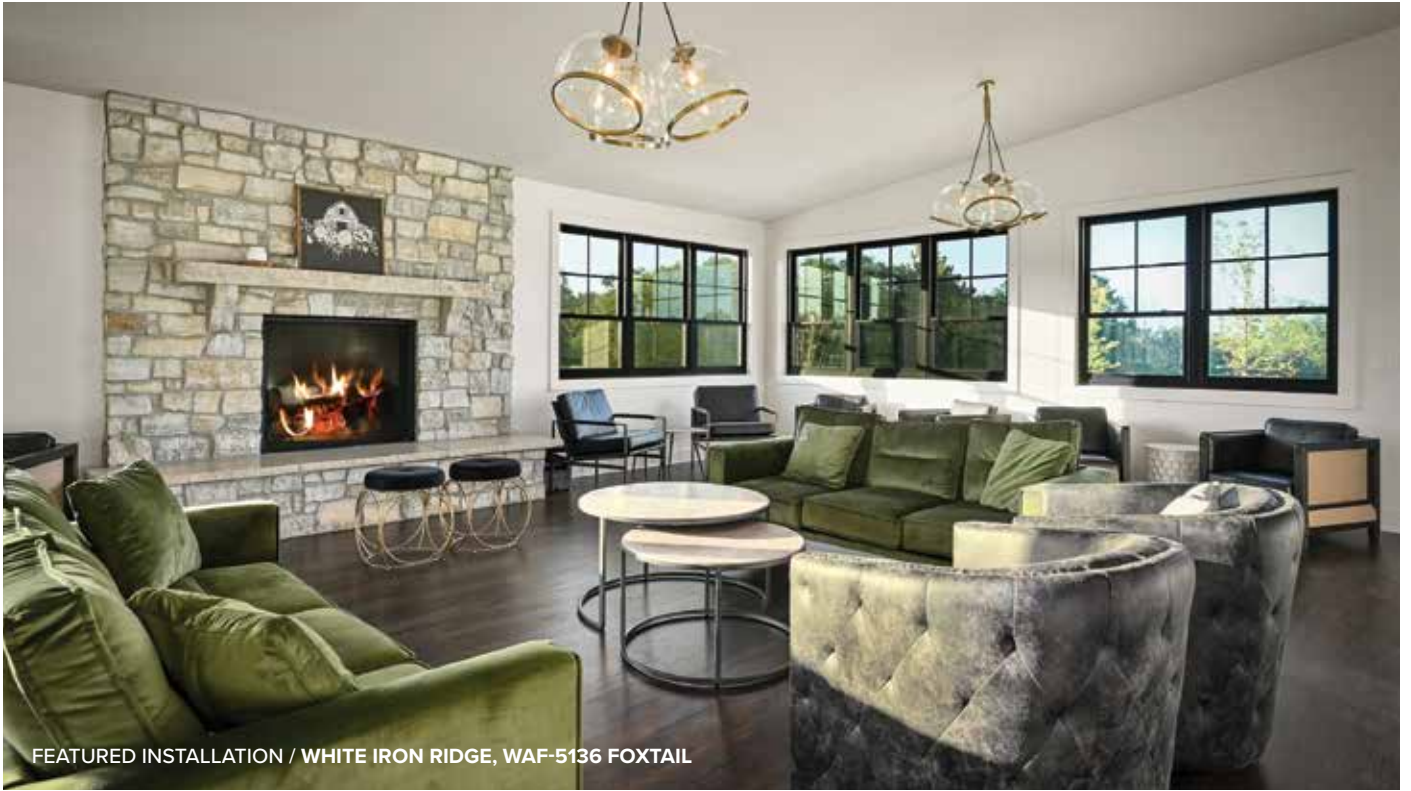
FEATURED INSTALLATION / WHITE IRON RIDGE, WAF-5136 FOXTAIL