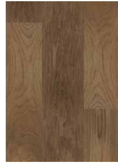
TAJ-792F Variable Oak | 7" x 48"