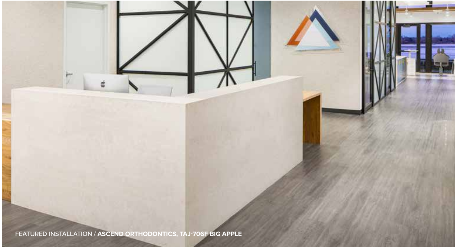
FEATURED INSTALLATION / ASCEND ORTHODONTICS, TAJ-706F BIG APPLE