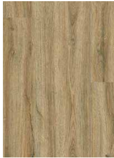
TAJ-9122 Camelback | 7" x 48"