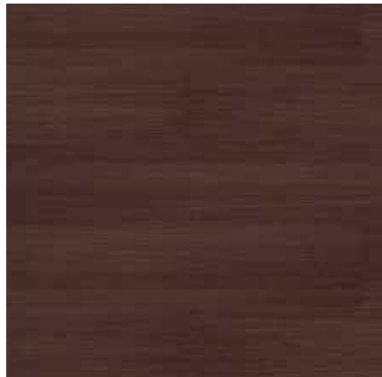
TAJ-661H-PF Cocoa 6" x 36", 3mm/20mil 8,424 SF | inquire for pricing