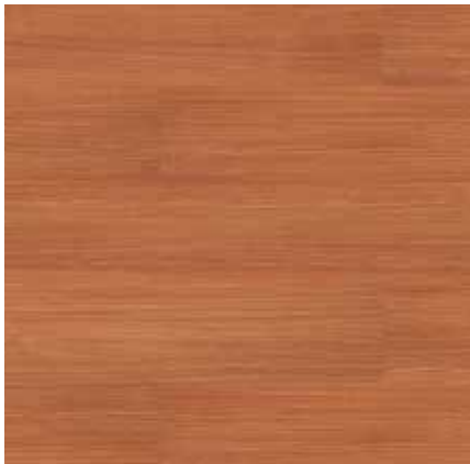
TAJ-654H-PF Copper 6" x 36", 3mm/20mil 4,284 SF | inquire for pricing