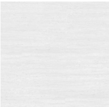
TAJ-9129W2 Travertine White

12" x 24", 2mm/8mil 14,900 SF | $0.75 per SF