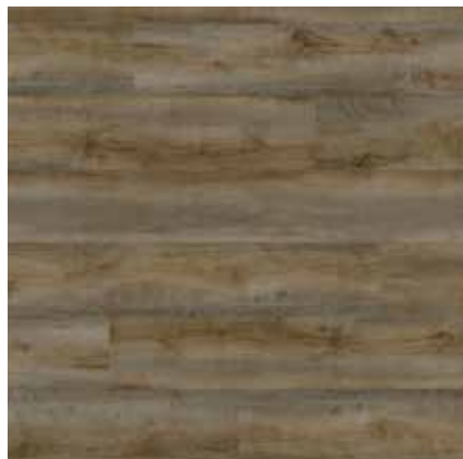
TAJ-759F Yella Wood

7" x 48", 3mm/28mil 2,625 SF | $1.25 per SF