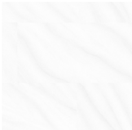
TAJ-9128W2 Soapstone White

12" x 24", 2mm/8mil 14,900 SF | $0.75 per SF