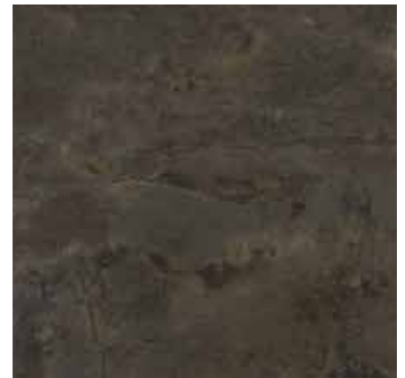
TAJ-501F2 Oil Stained

6" x 36", 3mm/20mil 62,352 SF | inquire for pricing