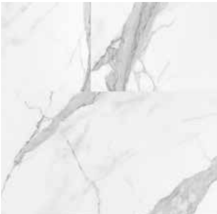
TAJ-9142W2 Marble Blanca

SCAN TO VIEW THE COLLECTION ON tajflooring.com OR CLICK HERE >