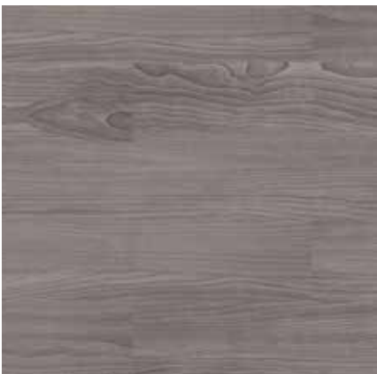
TAJ-664H-PF Cadet 6" x 36", 3mm/20mil 434 SF | inquire for pricing