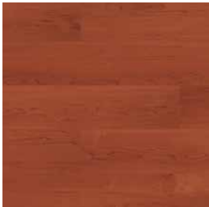
TAJ-658H-PF Roan 6" x 36", 3mm/20mil 8,748 SF | inquire for pricing