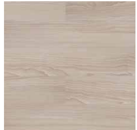
TAJ-663H-PF Taupe 6" x 36", 3mm/20mil 2,232 SF | inquire for pricing