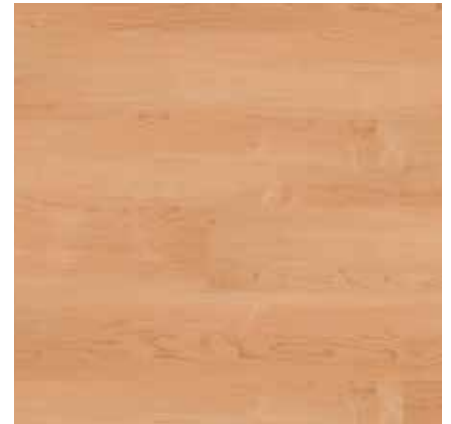
TAJ-652H-PF Praline 6" x 36", 3mm/20mil 864 SF | inquire for pricing