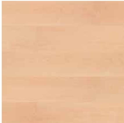
TAJ-651H-PF Ginger 6" x 36", 3mm/20mil 1,656 SF | inquire for pricing