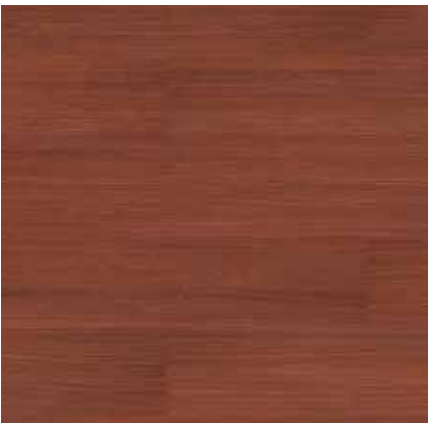
TAJ-657H-PF Priory 6" x 36", 3mm/20mil 8,856 SF | inquire for pricing