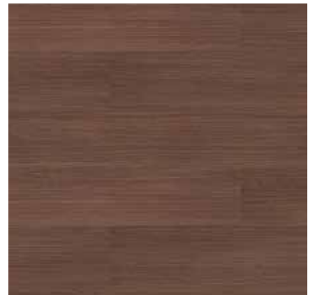
TAJ-659H-PF Kodiak 6" x 36", 3mm/20mil 3,888 SF | inquire for pricing