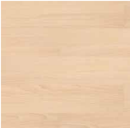
TAJ-650H-PF Straw 6" x 36", 3mm/20mil 6,984 SF | inquire for pricing