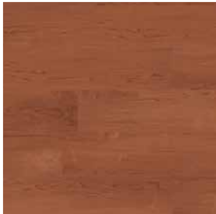
TAJ-655H-PF Rust 6" x 36", 3mm/20mil 6,768 SF | inquire for pricing