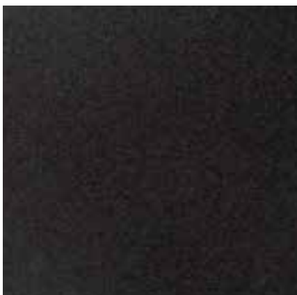
TAJ-190E Black Granite

7" x 48", 2mm/12mil 10,473 SF | $0.75 per SF