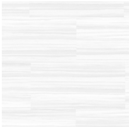
TAJ-9121W2 Zebra White

12" x 24", 2mm/8mil 14,900 SF | $0.75 per SF