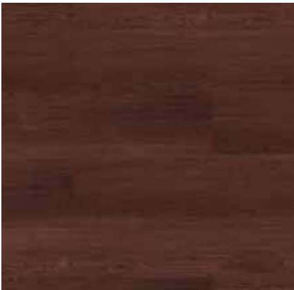
TAJ-660H-PF Angler 6" x 36", 3mm/20mil 8,856 SF | inquire for pricing