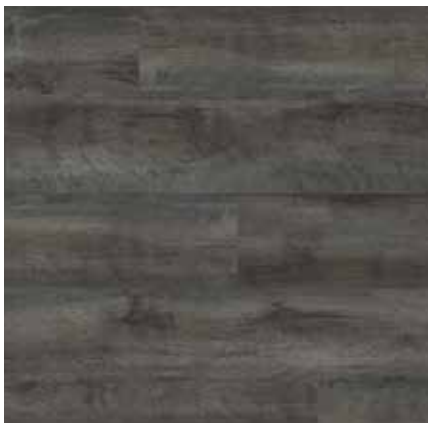
TAJ-758F Bleu Wood

7" x 48", 3mm/28mil 1,715 SF | $1.25 per SF