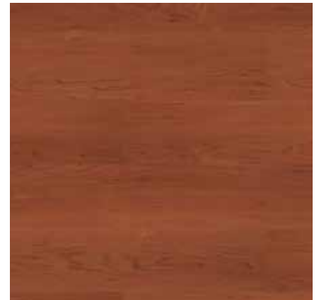
TAJ-656H-PF Peru 6" x 36", 3mm/20mil 7,632 SF | inquire for pricing