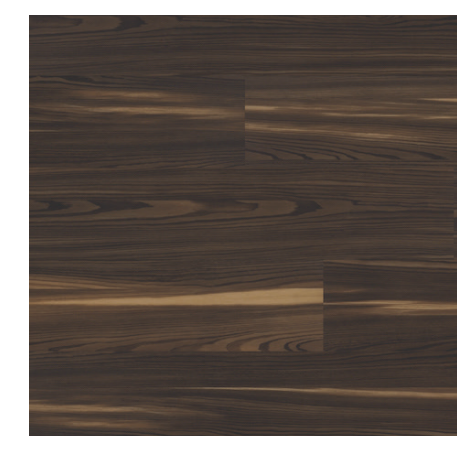
TAJ-756F Yakisugi 7" x 48", 3mm/28mil 315 SF | $1.25 per SF