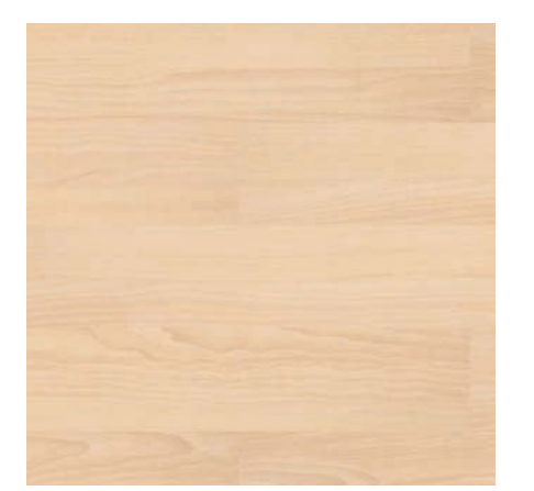
TAJ-650H-PF Straw 6" x 36", 3mm/20mil 6,984 SF | inquire for pricing