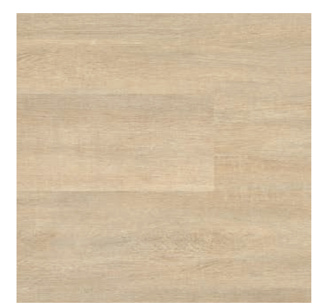
TAJ-6527F Oat 7" x 48", 3mm/20mil 17,815 SF | $1.25 per SF

SCAN TO VIEW THE COLLECTION ON tajflooring.com OR CLICK HERE >