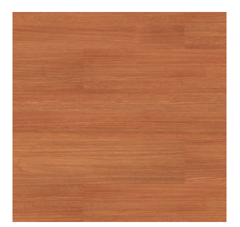
TAJ-654H-PF Copper 6" x 36", 3mm/20mil 4,284 SF | inquire for pricing