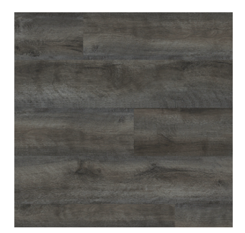
TAJ-758F Bleu Wood 7" x 48", 3mm/28mil 3,430 SF | $1.25 per SF