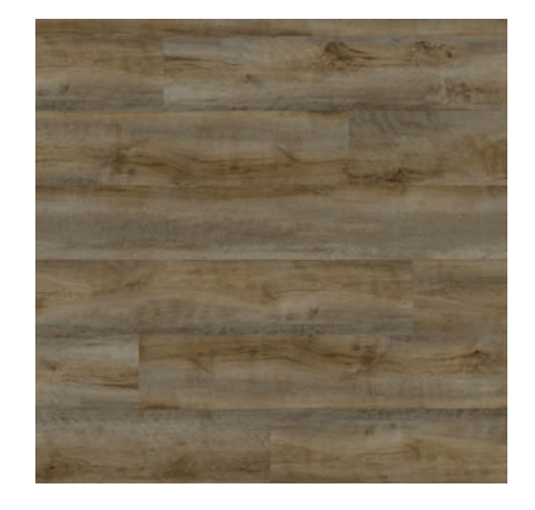
TAJ-759F Yella Wood 7" x 48", 3mm/28mil 6,825 SF | $1.25 per SF