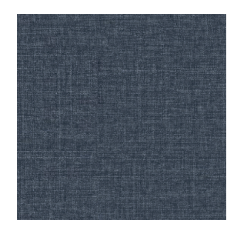
TAJ-6564D-IXPE Denim 7" x 48", 4MM+1MM IXPE backing 10,825 SF | $1.50 per SF