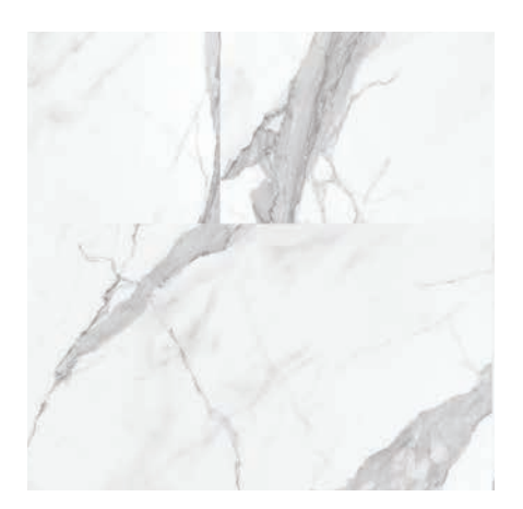
TAJ-9142W2 Marble Blanca 12" x 24", 2mm/8mil 14,900 SF | $0.75 per SF

SCAN TO VIEW THE COLLECTION ON tajflooring.com OR CLICK HERE >