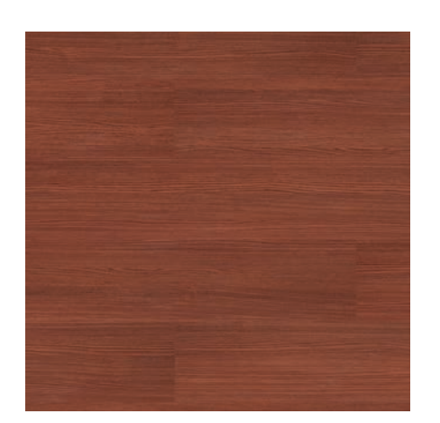
TAJ-657H-PF Priory 6" x 36", 3mm/20mil 8,856 SF | inquire for pricing