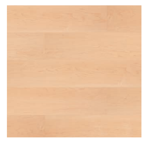
TAJ-651H-PF Ginger 6" x 36", 3mm/20mil 1,656 SF | inquire for pricing