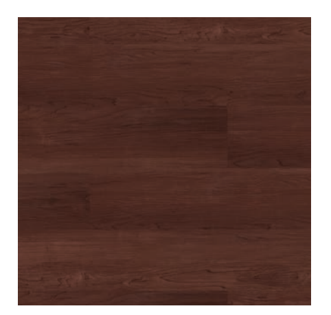
TAJ-660H-PF Angler 6" x 36", 3mm/20mil 8,856 SF | inquire for pricing