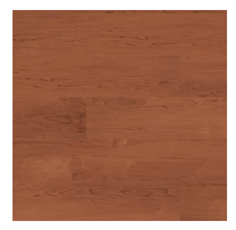
TAJ-655H-PF Rust 6" x 36", 3mm/20mil 6,768 SF | inquire for pricing