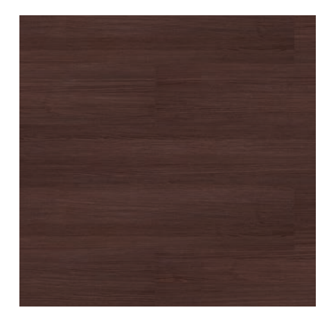
TAJ-661H-PF Cocoa 6" x 36", 3mm/20mil 8,424 SF | inquire for pricing