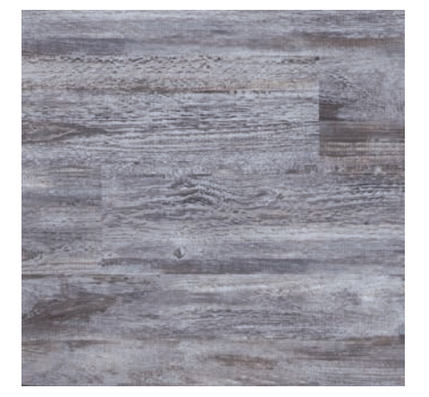
TAJ-6024SE-F Stonehenge 7" x 48", 3mm/20mil 490 SF | $1.25 per SF

SCAN TO VIEW THE COLLECTION ON tajflooring.com OR CLICK HERE >