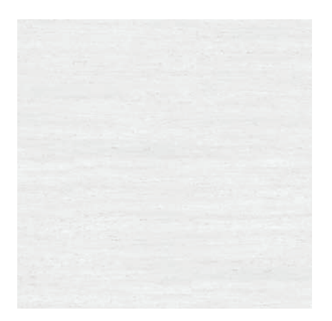
TAJ-9129W2 Travertine White 12" x 24", 2mm/8mil 14,900 SF | $0.75 per SF

2MM LUXURY VINYL TILE 12" x 24", 8MIL WEAR LAYER DRYBACK/ADHESIVE APPLICATION ASTM E84 CLASS A RATED TAJ-9128W2 Soapstone White