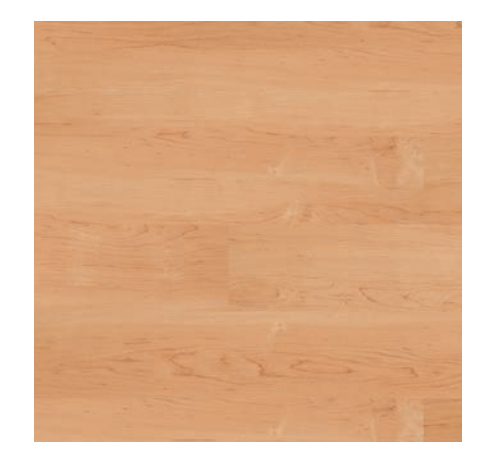
TAJ-652H-PF Praline6" x 36", 3mm/20mil864 SF | inquire for pricing