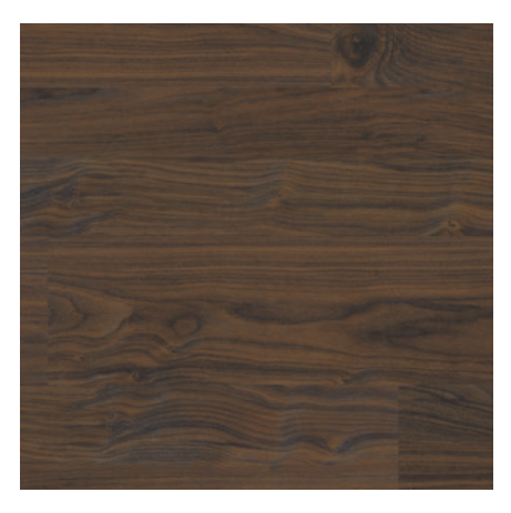
TAJ-757F Manchester 7" x 48", 3mm/28mil 1,715 SF | $1.25 per SF