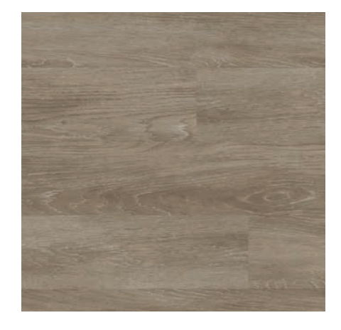
NVH-2701H2 River Birch 6" x 36", 2mm/12mil 1,566 SF | $0.75 per SF