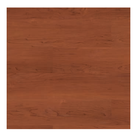
TAJ-656H-PF Peru 6" x 36", 3mm/20mil 7,632 SF | inquire for pricing