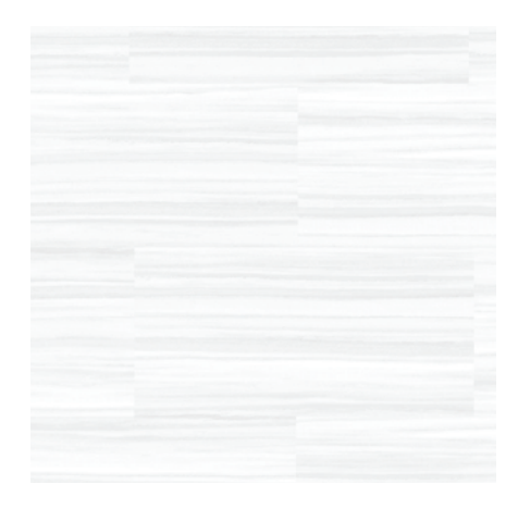
TAJ-9121W2 Zebra White 12" x 24", 2mm/8mil 14,900 SF | $0.75 per SF