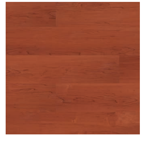
TAJ-658H-PF Roan 6" x 36", 3mm/20mil 8,748 SF | inquire for pricing