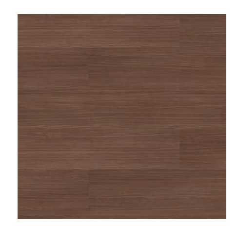
TAJ-659H-PF Kodiak 6" x 36", 3mm/20mil 3,888 SF | inquire for pricing