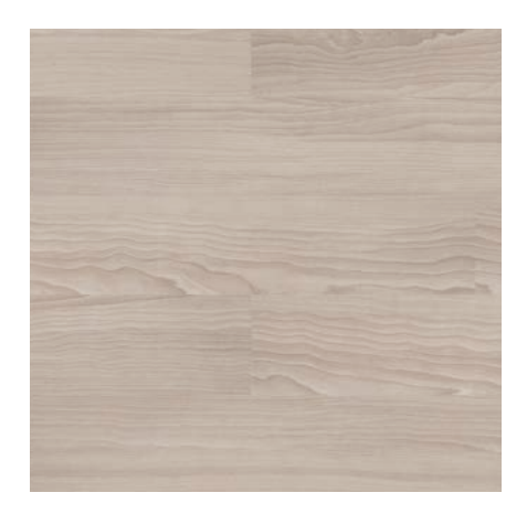
TAJ-663H-PF Taupe 6" x 36", 3mm/20mil 2,844 SF | inquire for pricing