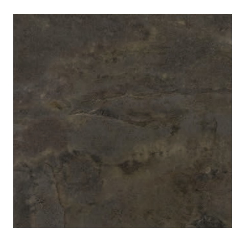
TAJ-501F2 Oil Stained 7" x 48", 2mm/12mil 10,473 SF | $0.75 per SF