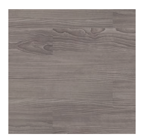
TAJ-664H-PF Cadet 6" x 36", 3mm/20mil 504 SF | inquire for pricing