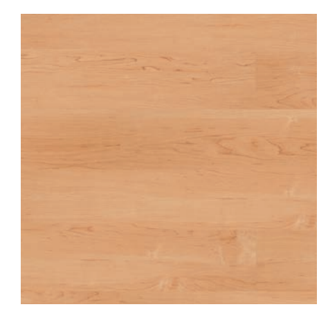
TAJ-652H3 Praline 6" x 36", 3mm/20mil 62,352 SF | $1.25 per SF