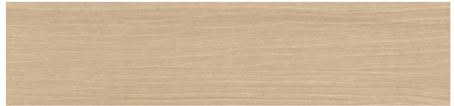
TAJ-650H-PF Straw | Coordinates with TAJ-214 Majestic Phthalate Free Sheet Vinyl