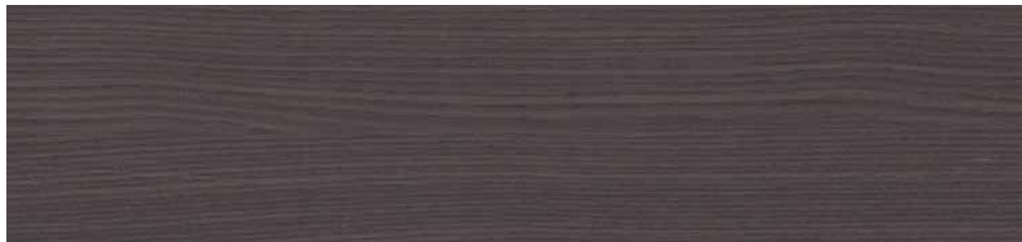
TAJ-661H-PF Cocoa | Coordinates with TAJ-254 Majestic Phthalate Free Sheet Vinyl