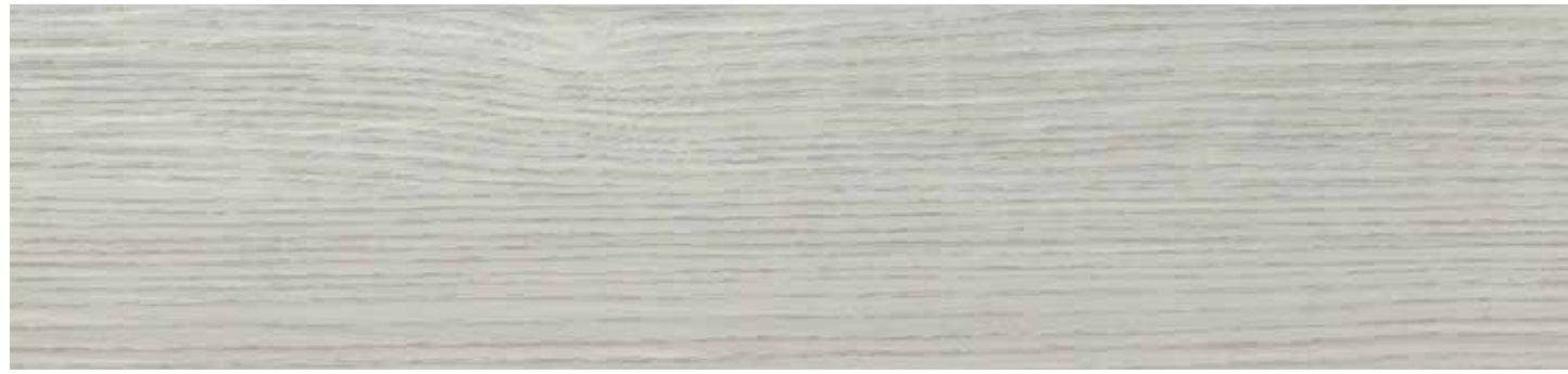
TAJ-662H-PF Platinum | Coordinates with TAJ-252 Majestic Phthalate Free Sheet Vinyl