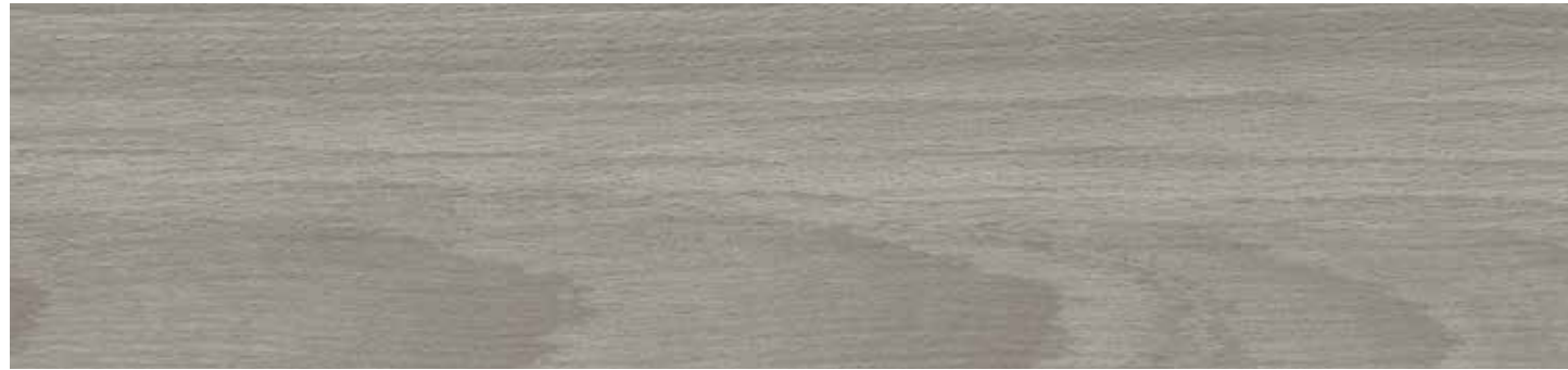
TAJ-663H-PF Taupe | Coordinates with TAJ-250 Majestic Phthalate Free Sheet Vinyl