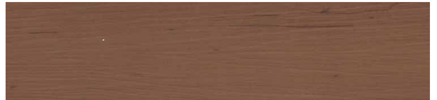
TAJ-656H-PF Peru | Coordinates with TAJ-208 Majestic Phthalate Free Sheet Vinyl