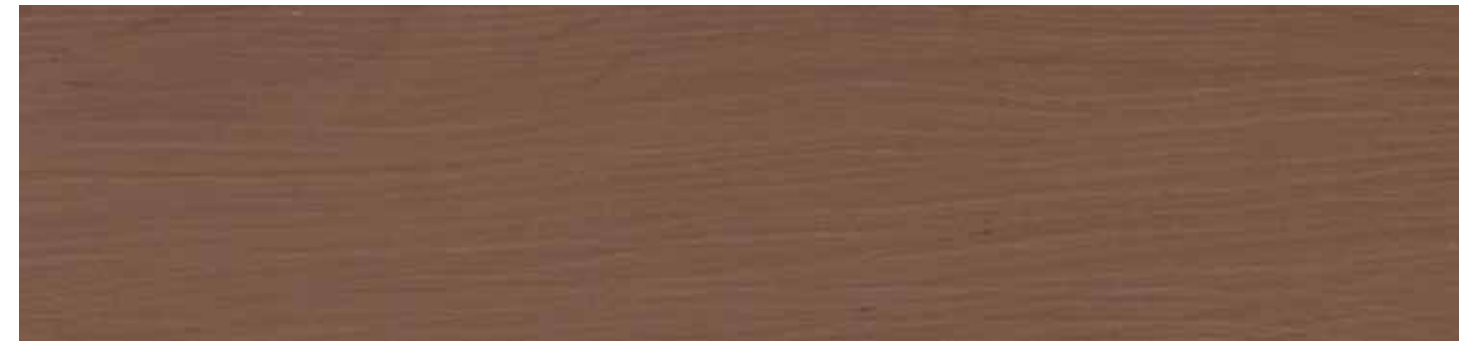
TAJ-655H-PF Rust | Coordinates with TAJ-261 Majestic Phthalate Free Sheet Vinyl