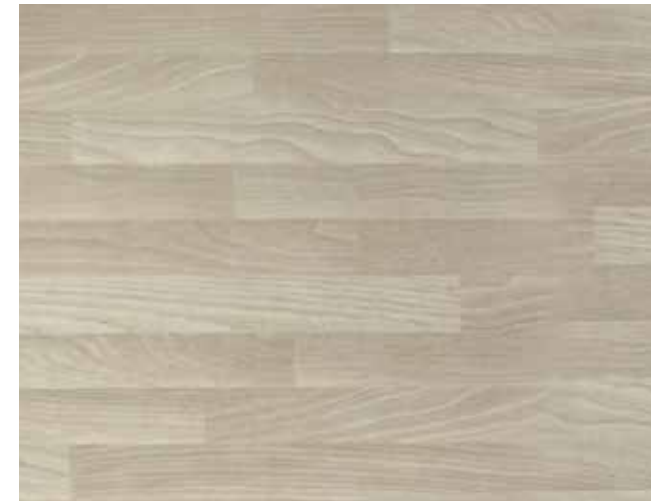
TAJ-250 Warm Gray