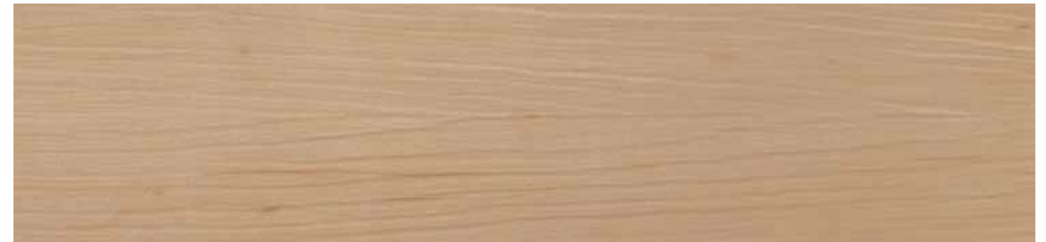
TAJ-651H-PF Ginger | Coordinates with TAJ-255 Majestic Phthalate Free Sheet Vinyl