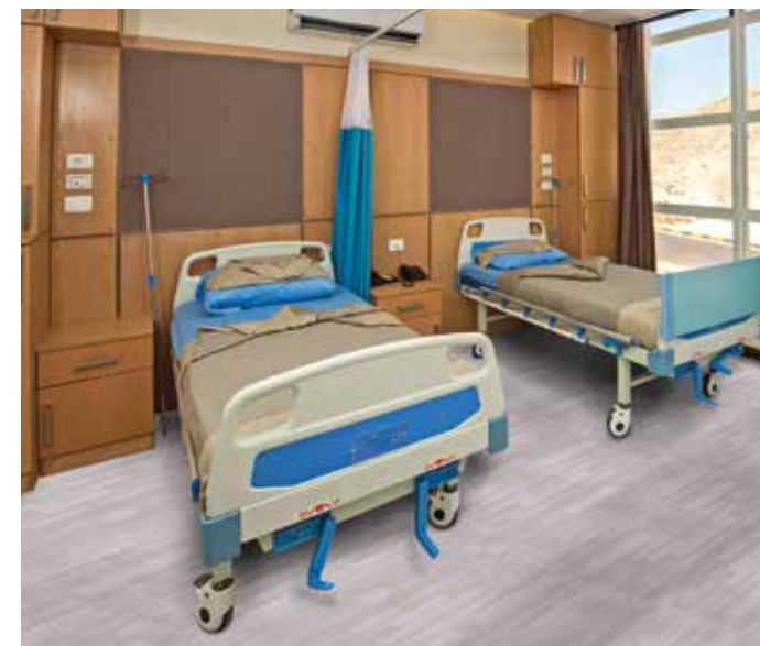
TAJ-250 Warm Gray