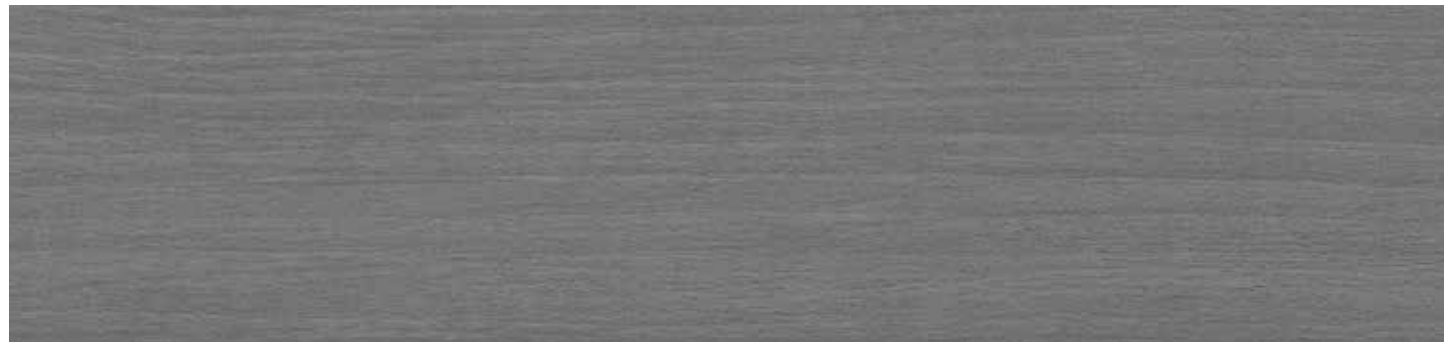
TAJ-664H-PF Cadet | Coordinates with TAJ-258 Majestic Phthalate Free Sheet Vinyl