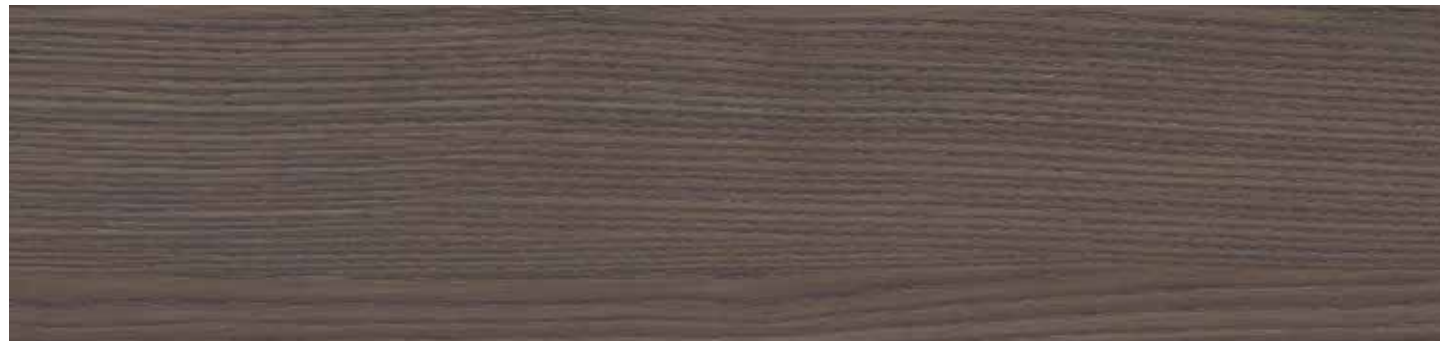
TAJ-659H-PF Kodiak | Coordinates with TAJ-253 Majestic Phthalate Free Sheet Vinyl