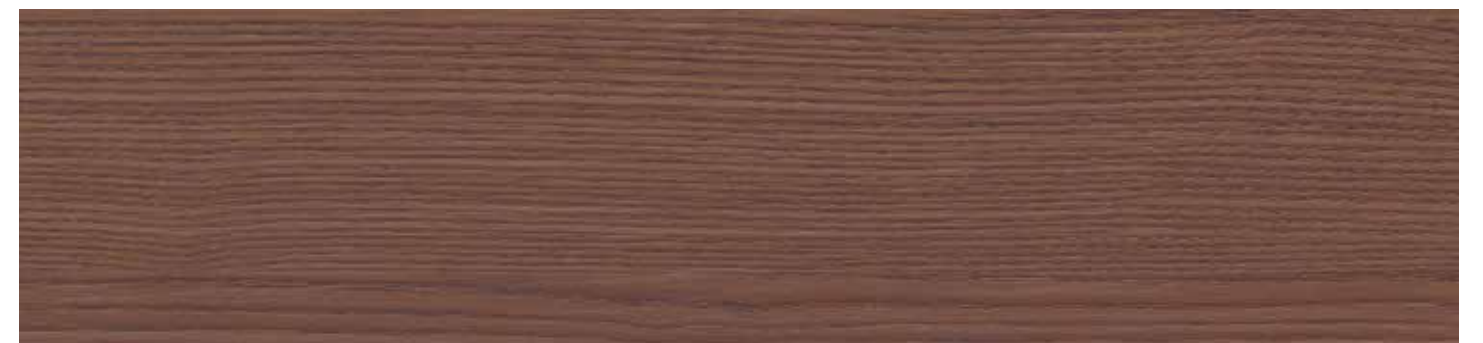
TAJ-657H-PF Priory | Coordinates with TAJ-657H-PF Majestic Phthalate Free Sheet Vinyl

Images are for reference only. Please order a physical sample to see actual color and texture.