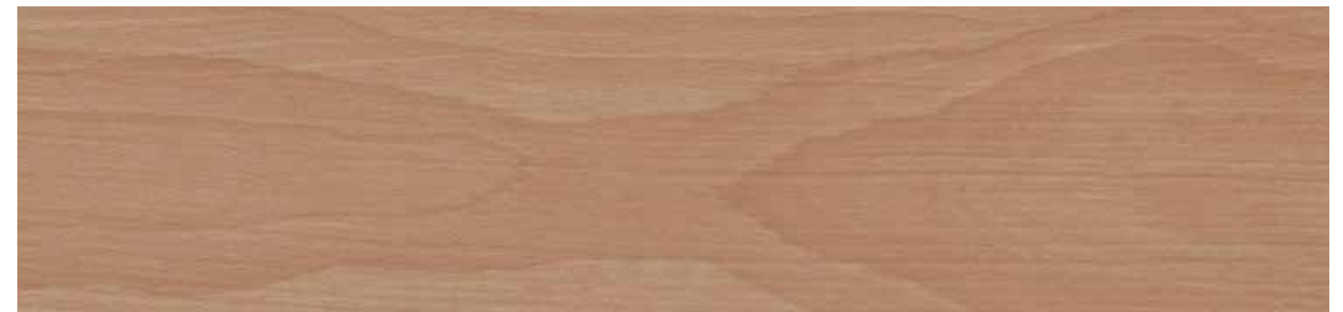
TAJ-653H-PF Caramel | Coordinates with TAJ-086 Majestic Phthalate Free Sheet Vinyl

Images are for reference only. Please order a physical sample to see actual color and texture.