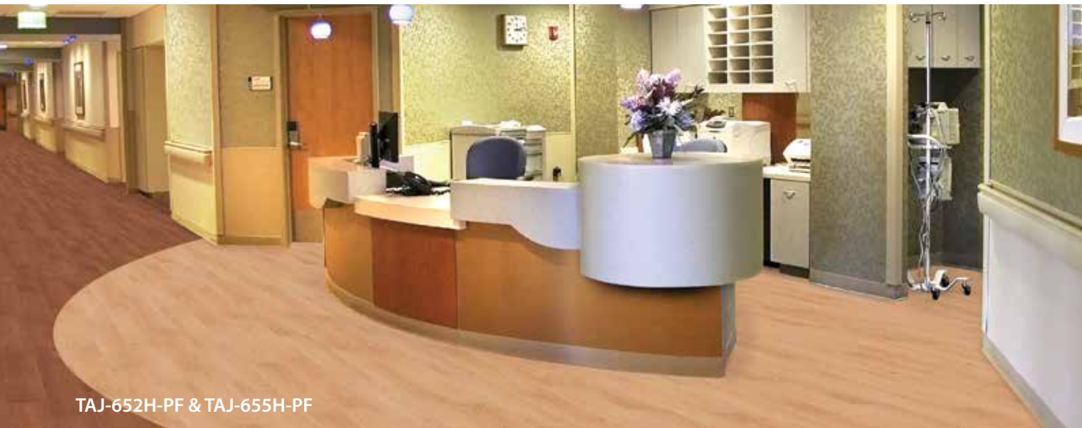
TAJ-652H-PF & TAJ-655H-PF