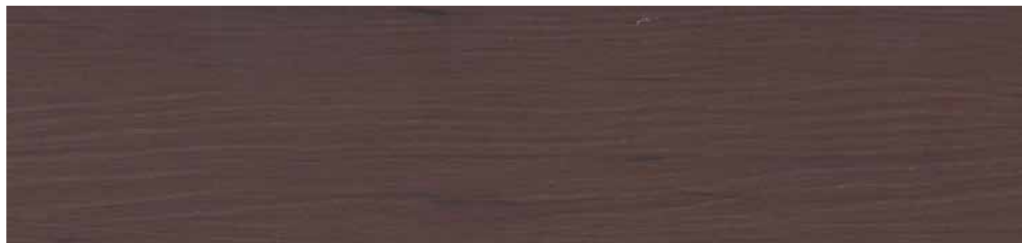
TAJ-660H-PF Angler | Coordinates with TAJ-257 Majestic Phthalate Free Sheet Vinyl