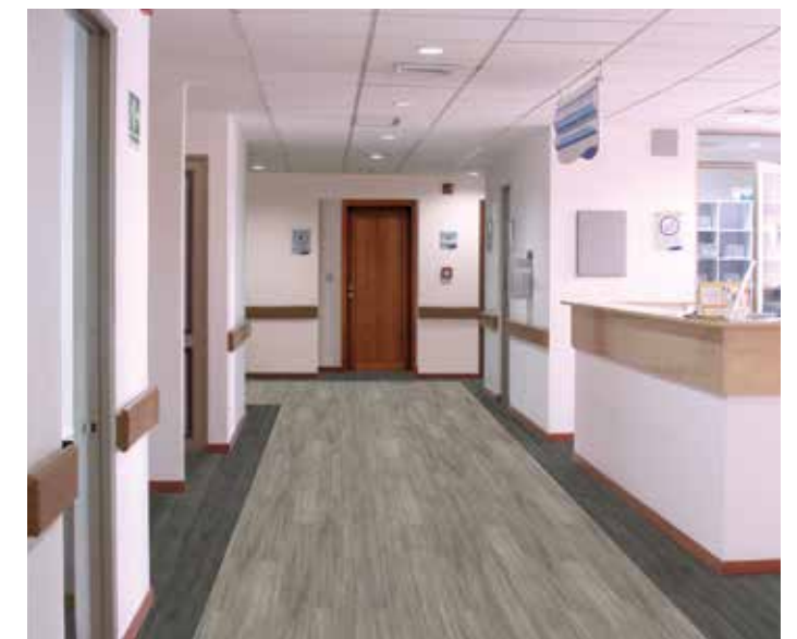
TAJ-664H-PF Cadet (border) TAJ-663H-PF Taupe (field)