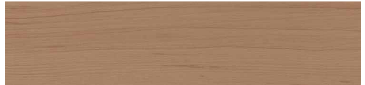
TAJ-652H-PF Praline | Coordinates with TAJ-256 Majestic Phthalate Free Sheet Vinyl