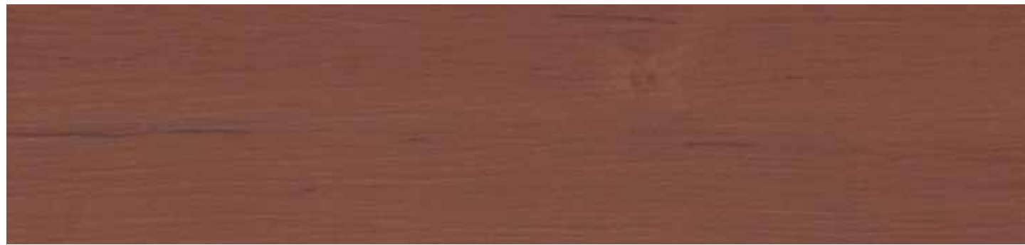
TAJ-658H-PF Roan | Coordinates with TAJ-260 Majestic Phthalate Free Sheet Vinyl