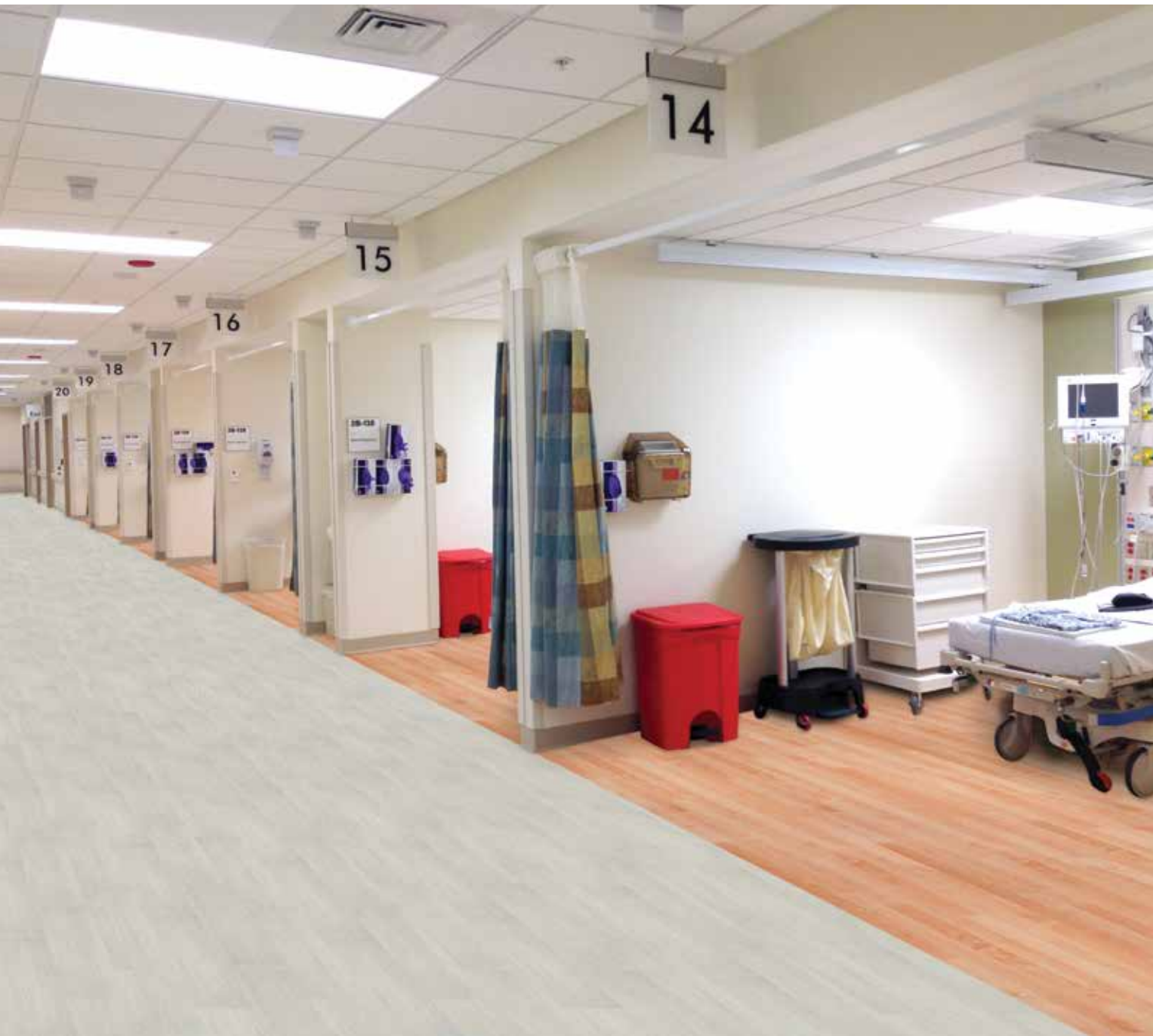
TAJ-255 Sundail (sheet in patient room) and TAJ-662H-PF (LVT in corridor)