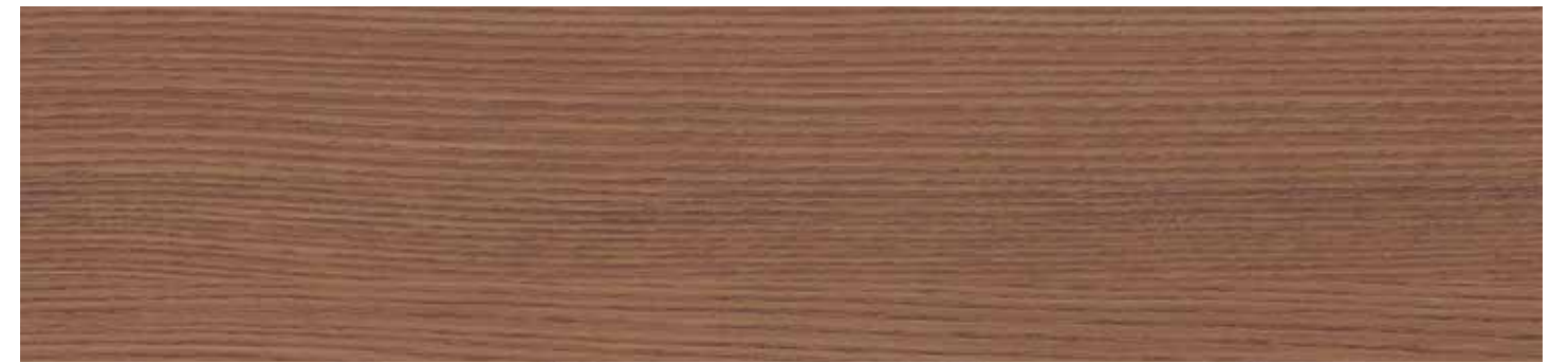
TAJ-654H-PF Copper | Coordinates with TAJ-210 Majestic Phthalate Free Sheet Vinyl