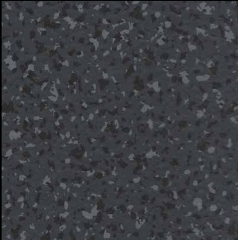
TAJ-8001Y Lockdown Dark | 18" x 18" Interlocking Tile