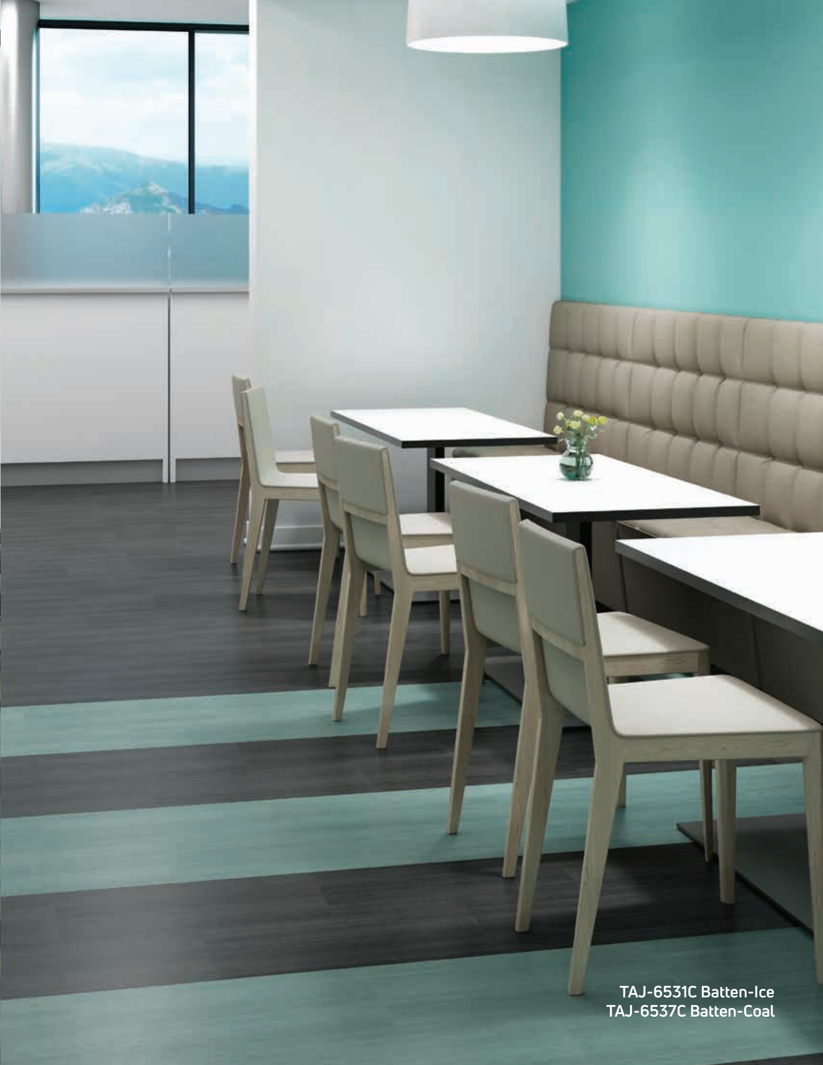
TAJ-6531C Batten-Ice TAJ-6537C Batten-Coal