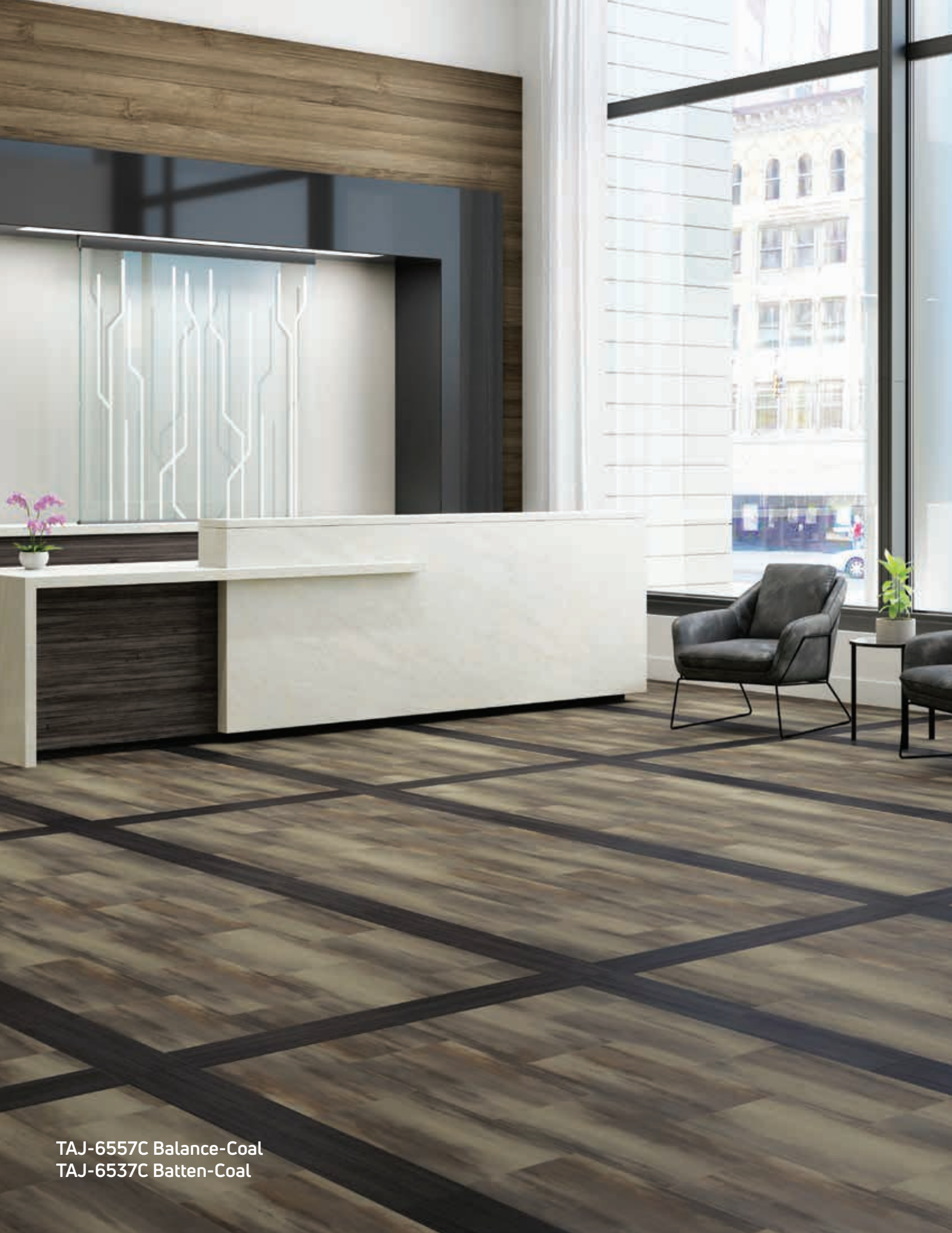
TAJ-6557C Balance-Coal TAJ-6537C Batten-Coal